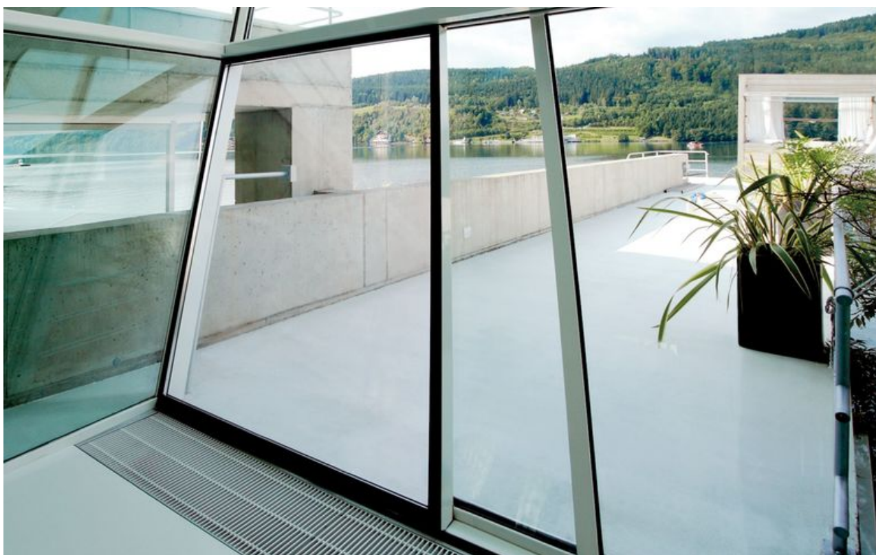
Automatic linear sliding door system for use on inclined glass façades